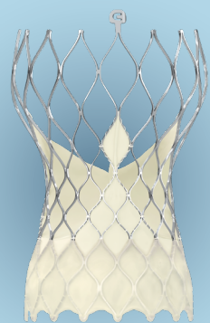
Evolut™ TAVR System